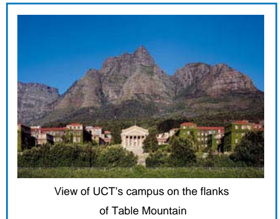
View of UCT's campus on the flanks of Table Mountain